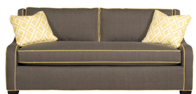
641 BARKLEY Sloped Wing Arm, To The Front Cushion, Welted Border Back/ Border Cushion*, 20" Throw Pillows (welted square corner) *Also available with French Seam option