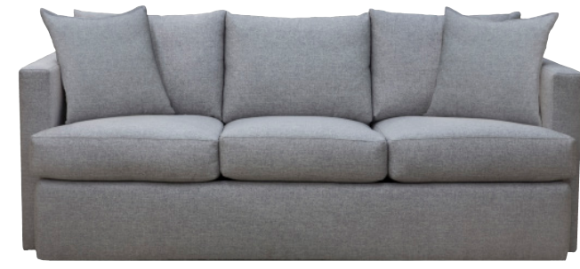
659 EMORY Recessed Track Arm, To the Front Cushion, French Seam Knife-Edge Back/French Seam Border Cushion, 20" Throw Pillows (lipstitch), Floating Base (no other base options)