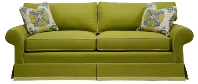
621 VIEWMONT Sock Arm, To The Front Cushion, Welted Border Back/ Border Cushion*, 20" Throw Pillows (welted square corner) *Also available with French Seam option