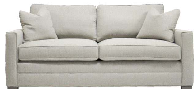
610 SUMMERTON Modern Arm, To The Front Cushion, Welted Border Back/ Border Cushion*, 20" Throw Pillows (welted square corner) *Also available with French Seam option