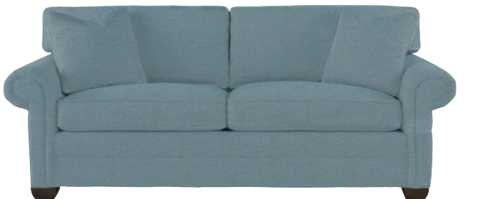
601 MAIN STREET Panel Arm, To The Front Cushion, Welted Border Back/ Border Cushion*, 20" Throw Pillows (welted square corner) *Also available with French Seam option