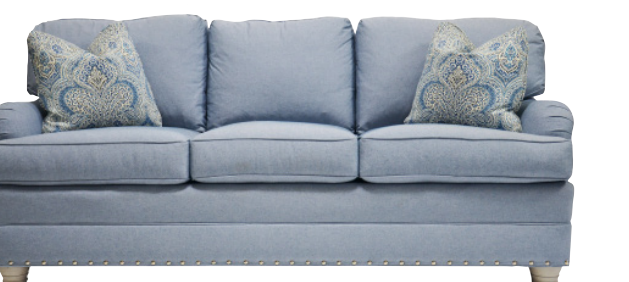
603 EAST LAKE English Arm, T-Cushion, Welted Knife-Edge Back/ Border Cushion*, 20" Throw Pillows (welted square corner) Not available with Metro, Mid Metro, Short Metro, Sled or Metal Cylinder Legs *Also available with French Seam option