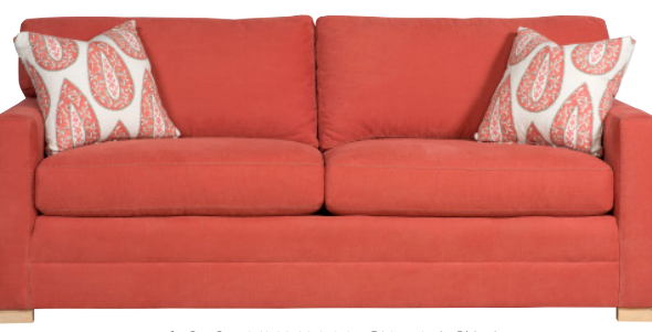
600 HILLCREST Track Arm, To The Front Cushion, Welted Border Back/ Border Cushion*, 20" Throw Pillows (welted square corner) *Also available with French Seam option