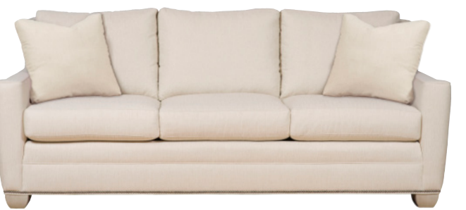
657 BROOKFORD Mid Century Arm, To the Front Cushion, French Seam Border Back/Border Cushion, 20" Throw Pillows (lipstitch) Not available with Dressmaker Skirt