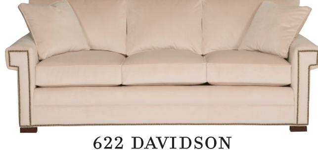
Greek Key Arm, To The Front Cushion, Welted Border Back/ Border Cushion*, 20" Throw Pillows (welted square corner) *Also available with French Seam option