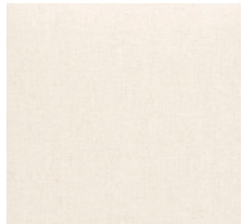
Plain Top (P) French Seam, Poly Dacron