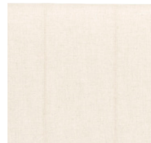
Channel Seam Top (C) French Seam, Poly Dacron