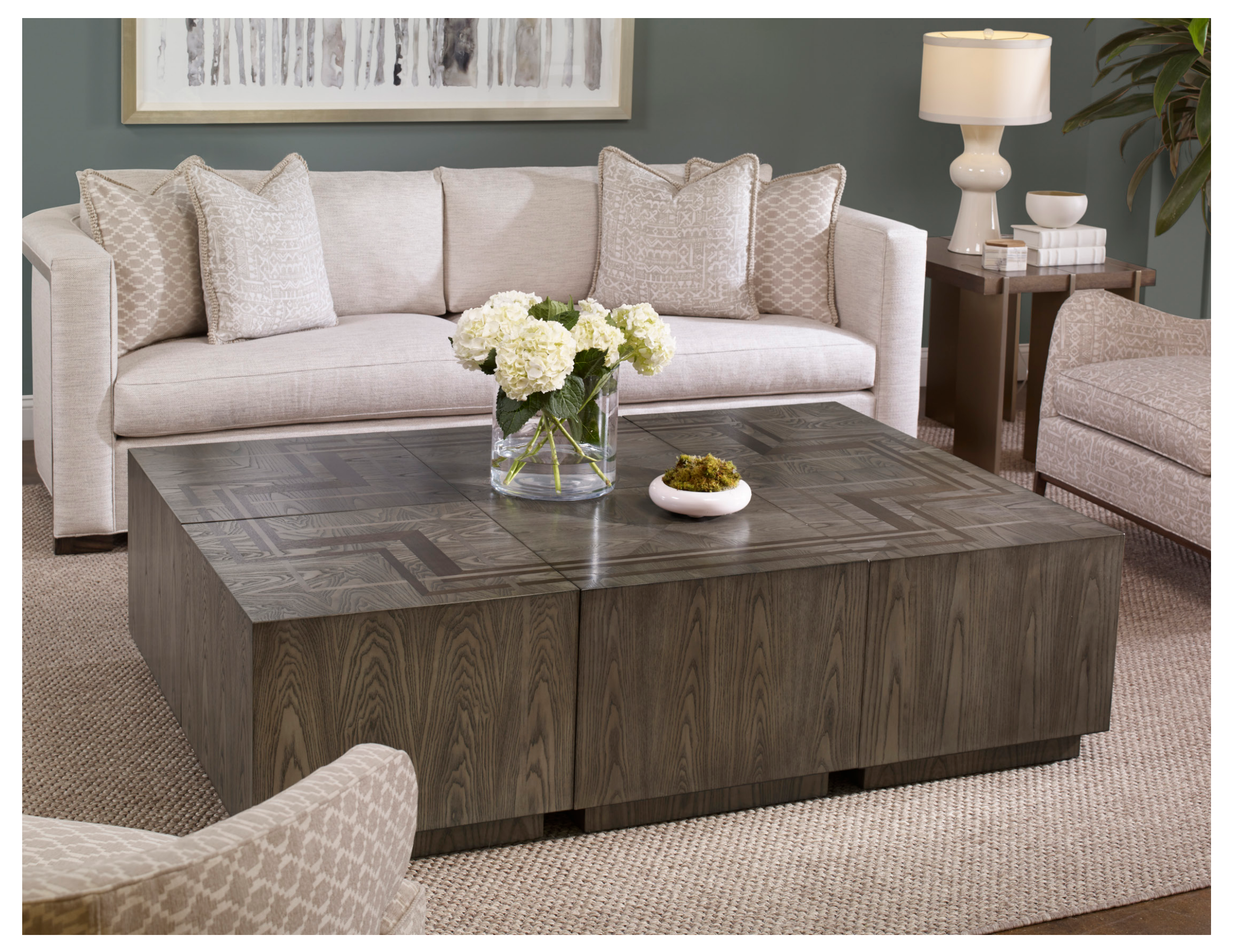
• Above Left to Right: V842-SW Lacey Swivel Chair. Fabric: Holden Sand; optional* Cord Braid Wool on seat cushion. P543C-SH Montreux Bunching Cocktail Corners (4). Finish: Shaded Slate. P544C-SH Montreux Bunching Cocktail Centers (2). Finish: Shaded Slate. P546C-SH Montreux Bunching Cocktail Clean. V866-2S Brandt Sofa. Fabric: Impala Linen; two standard 20" throw pillows (lipstitch) in Holden Sand with optional* Fringe Nubby Wool; two extra* MPS20 pillows in Soho Linen with optional* Fringe Nubby Wool. Finish: Shaded Slate. P516L-SH Steps Side Table. Finish: Shaded Slate. Satin Brass Legs. V840-CH Sophie Chair. Fabric: Soho Linen; one standard 12"x22" kidney pillow in Soho Linen. Finish: Shaded Slate. *Optional charges may apply.