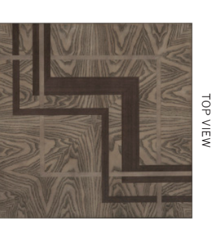
P543C Montreux Bunching Cocktail Corner W 22 D 22 H 18 P543C-SH. Finish: Shaded Slate.