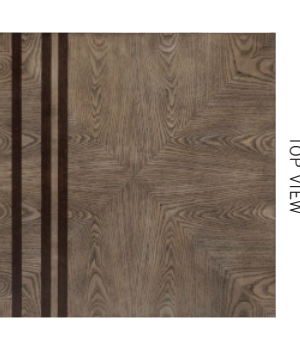
P544C Montreux Bunching Cocktail Center W 22 D 22 H 18 P544C-SH. Finish: Shaded Slate.