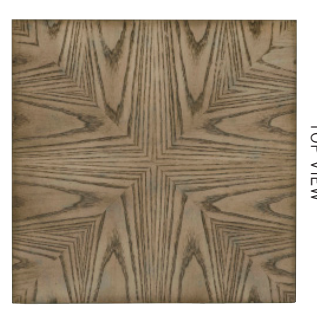
P545C Montreux Bunching Cocktail Clean W 22 D 22 H 18 •• P545C·AJ. Finish: Arles.